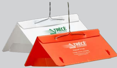
PHEROCON® VI Delta Trap