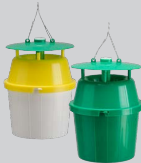
PHEROCON® Bucket Trap