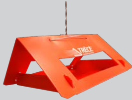
PHEROCON® VI Delta Modified Trap