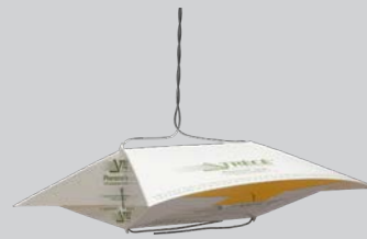
PHEROCON® 1CP Trap