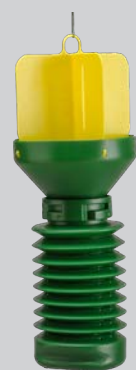
PHEROCON® Japanese Beetle Xpando Trap