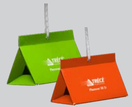
PHEROCON® IIID Trap