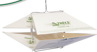
PHEROCON ® 1C Trap