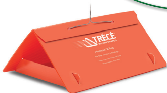
PHEROCON ® VI DELTA Trap